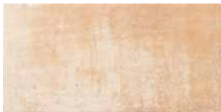
TERRE D'ITALIA URBINO 20x40