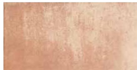
TERRE D'ITALIA PIENZA 20x40