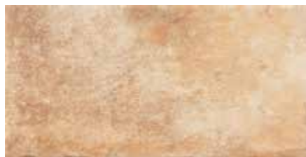
TERRE D'ITALIA DERUTA 20x40